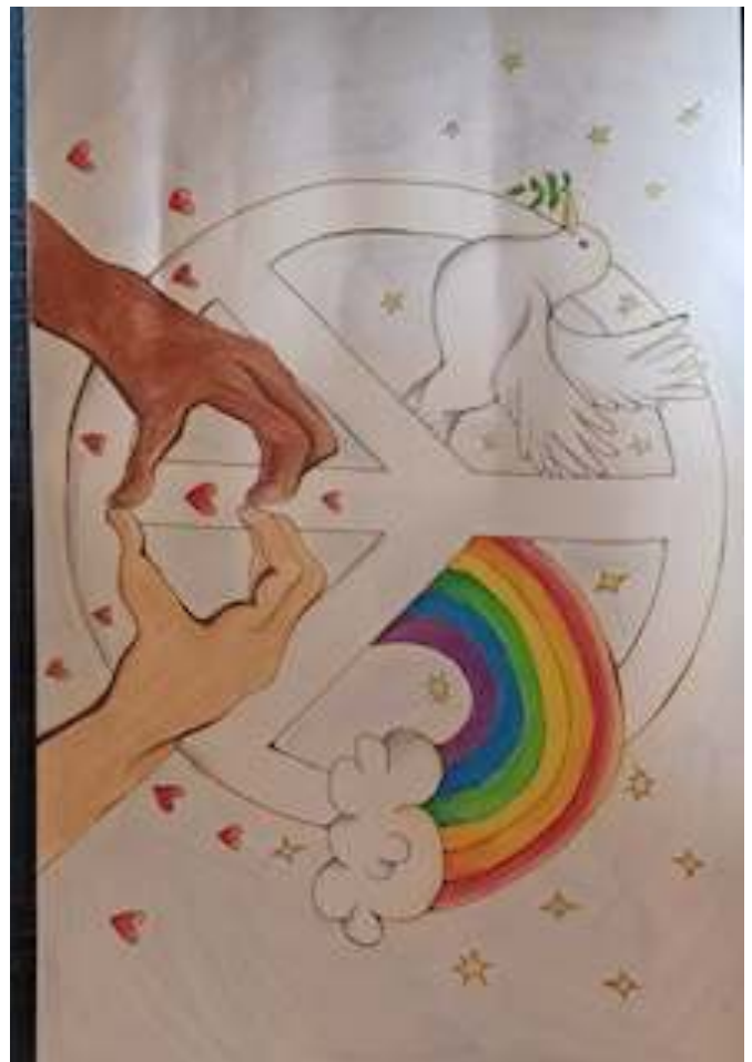
Peace Posters Were Judged ... at the Cabinet meeting on November 19, 2022.