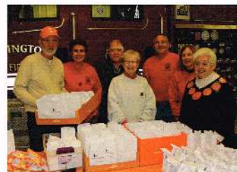
Arlington Lions Club Members at Trick-or-Treat, 2019

The Lions Club-deemed the "Knights for the Blind" by Hellen Keller in 1925-serves and advocates for the blind and visually impaired through their SightFirst humanitarian program. The group collects used eyeglasses which are repurposed and sent to third-world countries. Optometrists, ophthalmologists, and surgeons travel internationally via Lion-sponsored trips to administer eye exams, issue life-altering glasses, and perform cataract surgeries. Recipients of these services often wait in line for days to be examined and as many as 70 surgeries are conducted a day. This year, Arlington's chapter collected over 200 pairs of glasses for the Recycle for Sight program.