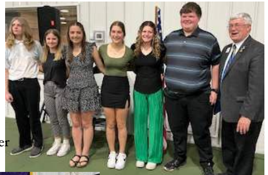
(Above) LEOs ready to greet guests and help where needed.