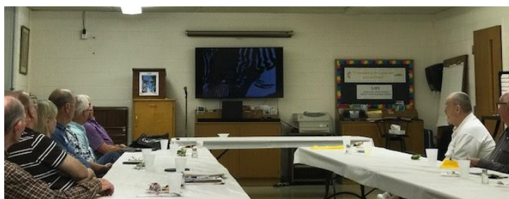
Bryan Lions September meeting.

Want to see pictures of your club in the newsletter? Send photos to jreichley@gmail.com or text them to 419-721-4052 with a description!