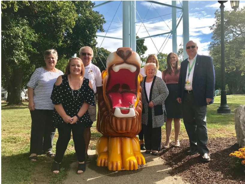
New fountain in Burnham Park provided by Sylvania Lions.

4th Cabinet Meeting - District Convention -April 3 or 4th. TBD