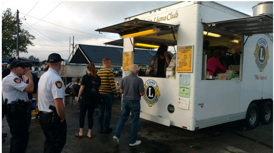
Venedocia Lions serving sausage at the Van Wert County Fair