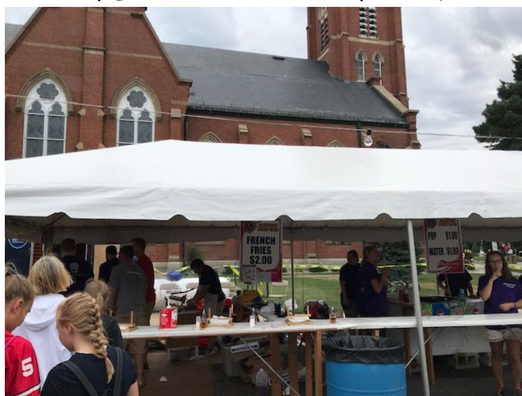
Glandorf Lions at the Glandorf Park Festival