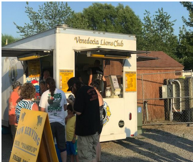
Venedocia Lions serving sausage at St. Jude's Fundraiser