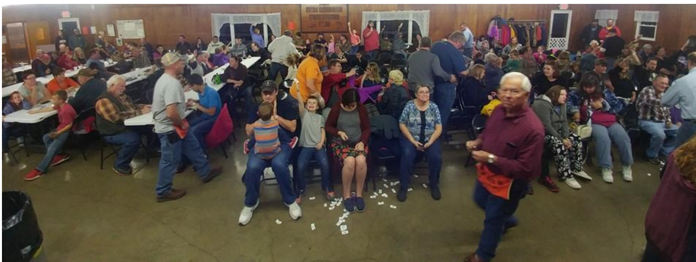
69th annual West Mansfield Lions Club Turkey Raffle.