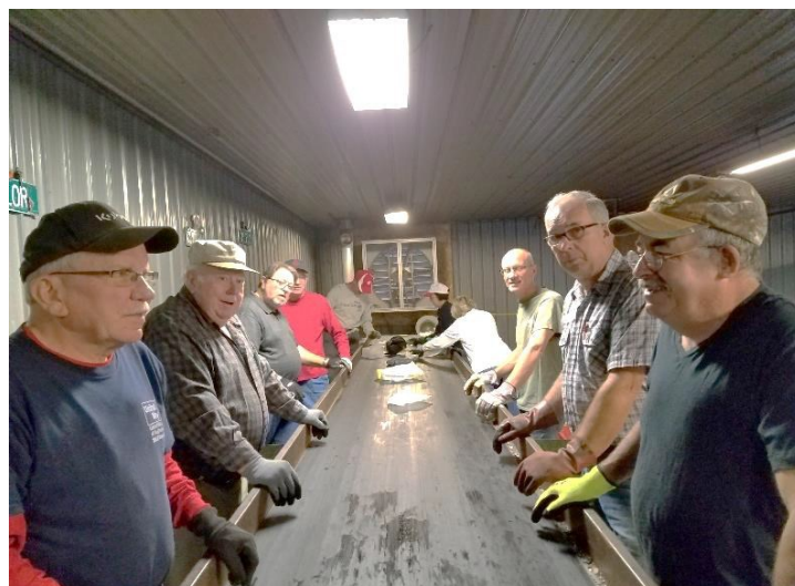
Wapak Lions working at the recycle center.

February 10, 2018: State Committee Meetings & 3rd Council of Governors Meeting .