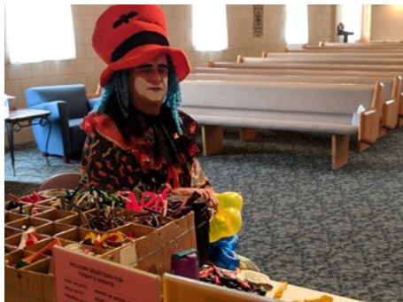
Happy the Clown making balloon animals.