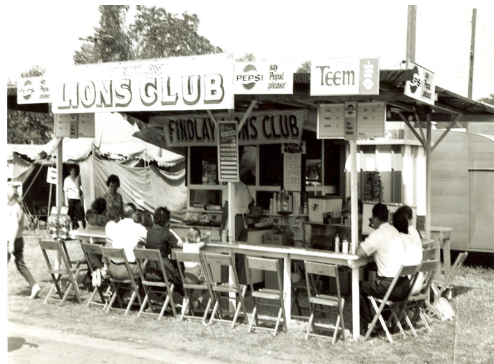
1970 Findlay Lions Fair Booth.