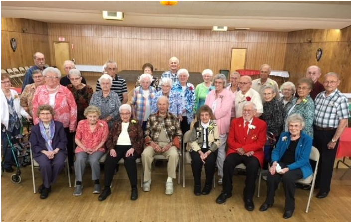
McComb Lions Club had a great turn out at their 52nd Over 80's Party at the McComb American Legion.