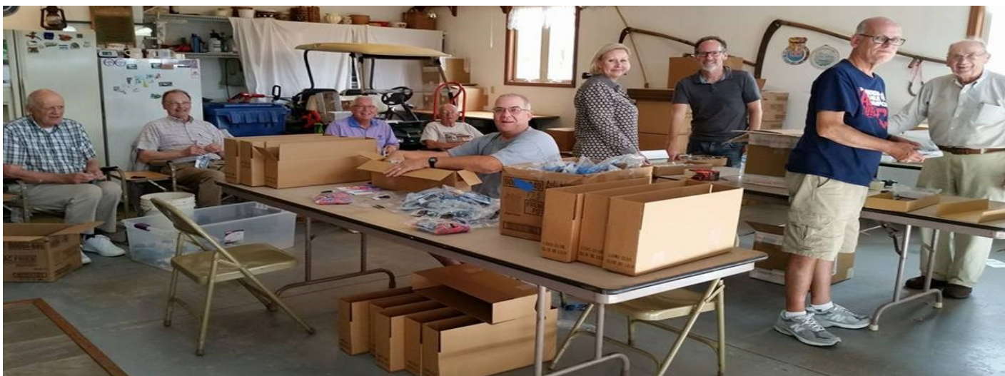
Bluffton Lions jumped into helping pack glasses for a St. Maarten VOSH mission sponsored by the St. Maarten's Lions Club. This has been rescheduled for the spring, due to hurricane damage.

Celebrate Your Service: Share photos of your project on social media so everyone can see what a difference you're making in your community.