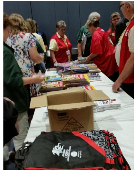
Photo (right) shows attendees packing children's books for pediatric hospitals within the state, as the service project for the USA/Canada forum held in Columbus, OH September 20 through 22 nd .