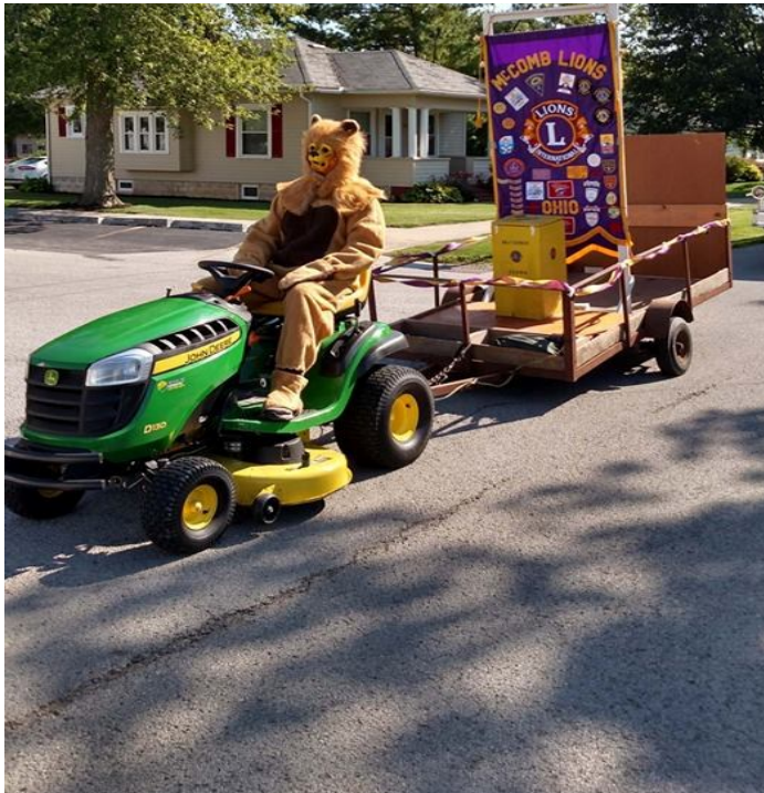
McComb Cookie Festival Parade 8/5/2017