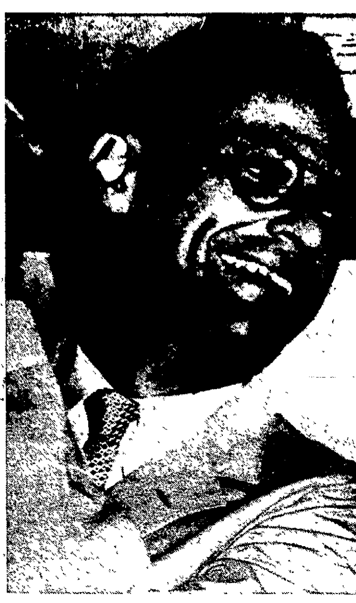
SENTENCED — Playwright Arthur Miller makes a gesture as he talks with newsmen after being sentenced for contempt of Congress. Federal District Judge Charles McLaughlin, in Washington, imposed a $500 fine and gave Miller, the husband of actress Marilyn Monroe, a one-month suspended jail term. He also turned down a new motion asking a reversal of the 41-year-old playwright's conviction. (AP Wirephoto)

MOSCOW, July 19 (AP)—The Soviet defense ministry brought out planes, tanks, artillery and infantry today in a military display for visiting King Mohammed Zahir of Afghanistan.