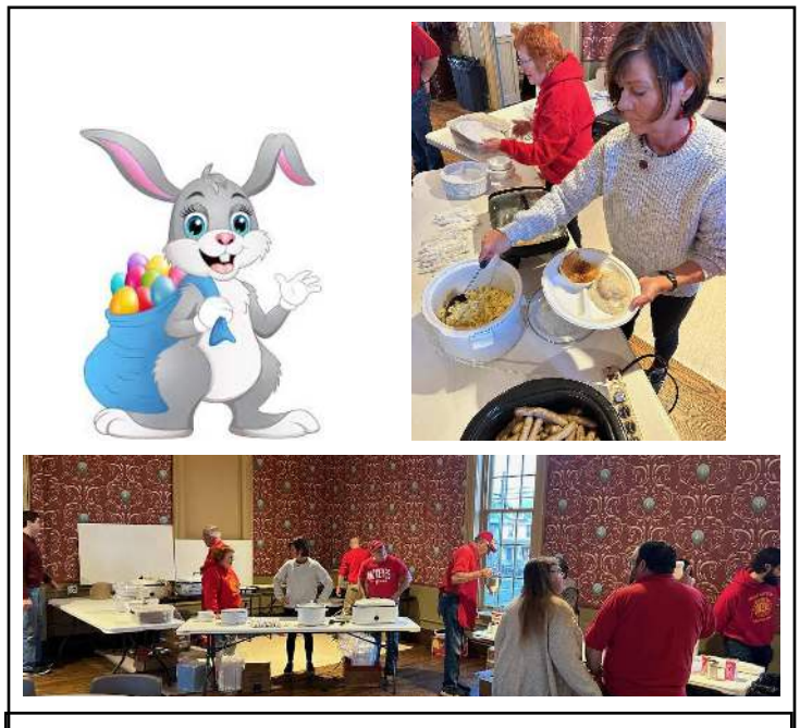
Vision Screening at the Gingerbread House Preschool.