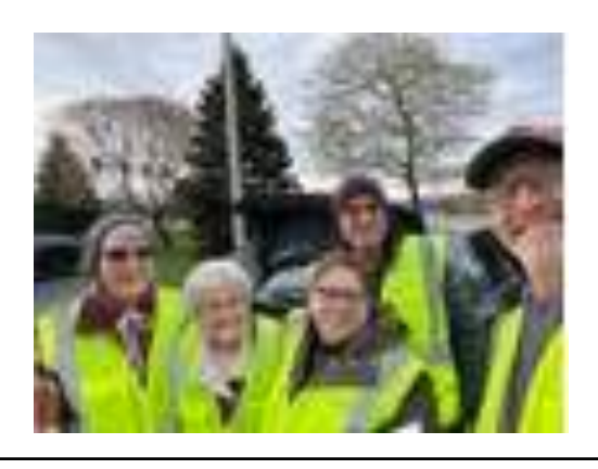
Sylvania Lions Pack Easter Baskets

Sylvania Lions do trash pick up along Monroe Street in Sylvania and I-475 exchanges. Keeping our town looking good.