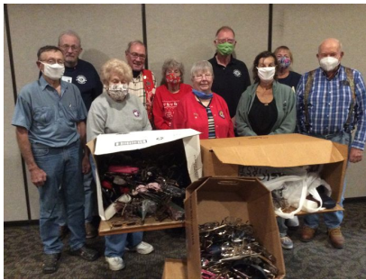
Left: Pioneer Lions Club, 1007 collected eyeglasses for "Fall into Service" project.

Together, the Lions of OH1 truly made a difference with their Fall Into Service projects. Together, We Serve!