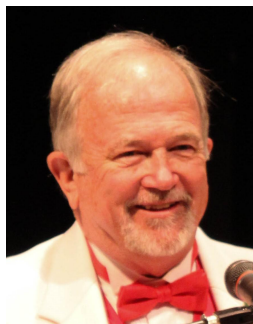
GOVERNOR DAVE STOCKUM

Best wishes for a great September as school with all its activities resume.