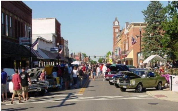
Over 200 cars participated in the Festival of Wheels project of the Bluffton Lions