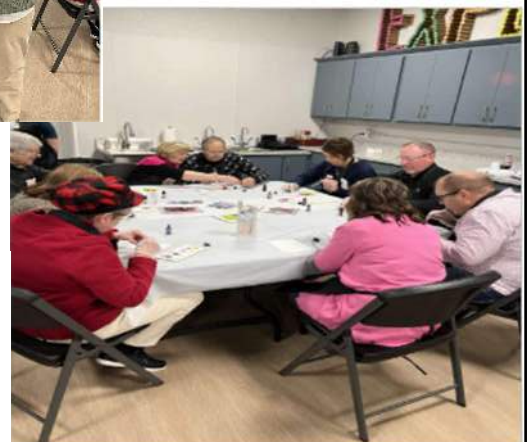
(Below) A group hard at work enjoying crafts and fellowship