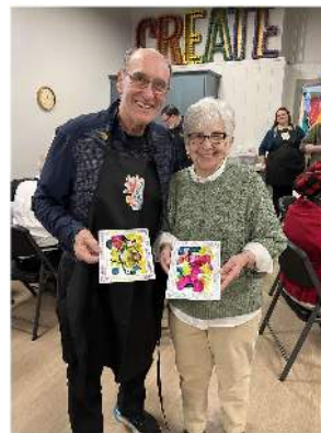
(Left) Lions displaying their artistic handiwork

At our February 18 th meeting, members brought their significant other out for supper and a project time at the new Black Swamp Arts store. The Arts Council recently opened the store for shows, classes, etc. Members learned about using alcohol based paints.